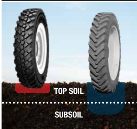
VF Tire Standard Radial Tire